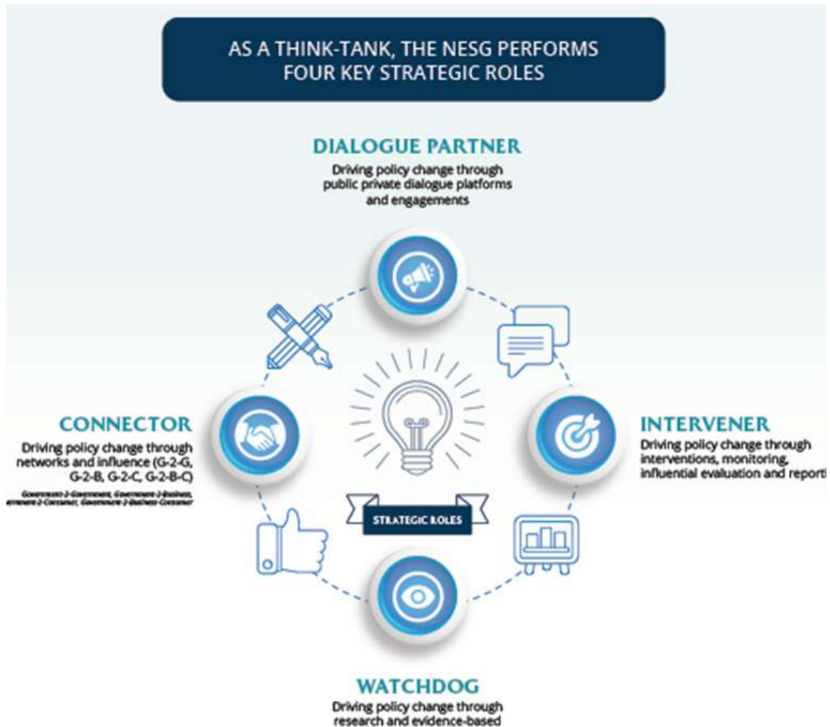
Figure 1: The NESG Think-Tank Model

As a private-sector-led think-tank organisation, the NESG adopts a four-pronged approach to achieving its mandate (See Figure 1). These strategies include serving as Dialogue Partner, Connector, Intervener and Watchdog on the Nigerian economy.